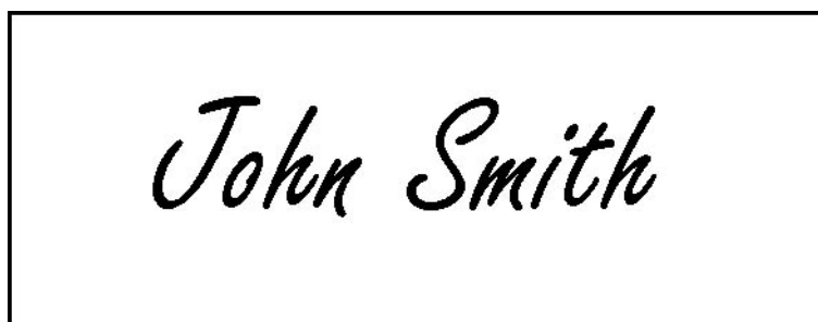
Actual size of the name label

He will then print a name label, in the style below, and send this to the chosen driver to be placed on their race car.